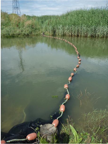
Figure 1. Seine net blocking an intertidal backwater near Barking to sample fish populations. (Early stage of succession).